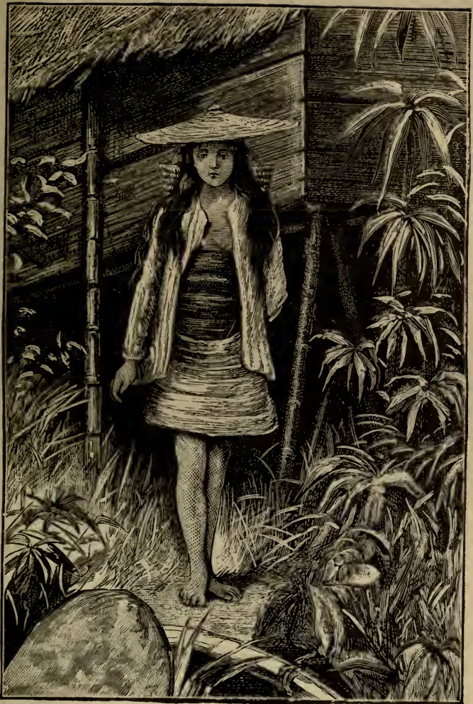
A DYAK GIRL.