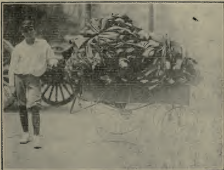
BABY CARRIAGE FILLED WITH ARMY UNIFORMS TO BE FINISHED IN TENEMENT HOUSE.