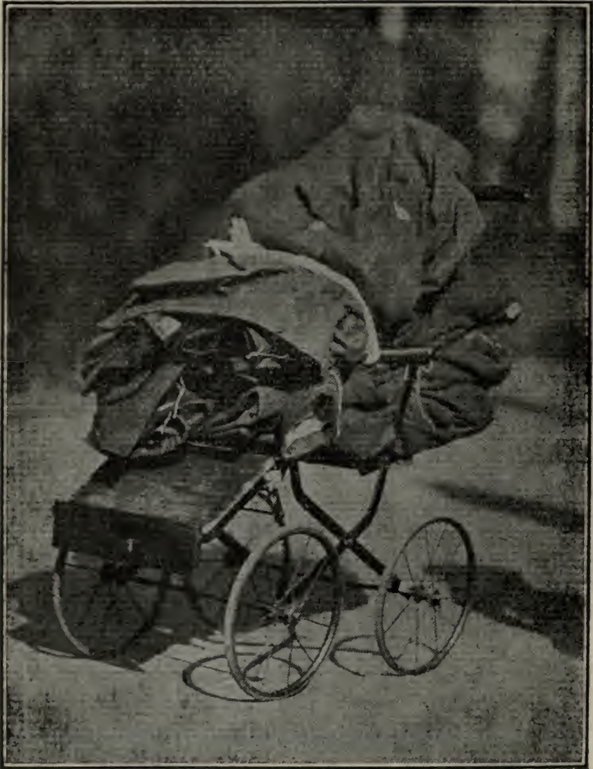
BABY CARRIAGE FILLED WITH ARMY UNIFORMS TO BE FINISHED IN TENEMENT HOUSE.