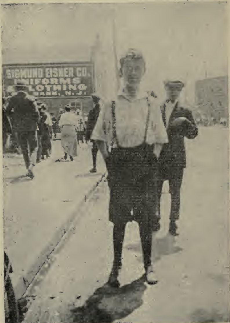
CHILD LABOR EMPLOYED IN THE MANUFACTURE OF ARMY UNIFORMS