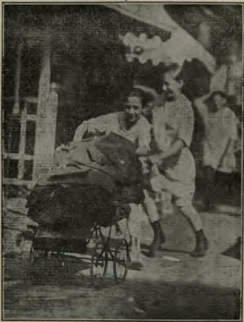
CHILDREN TAKING ARMY UNIFORMS ON BABY CARRIAGE FOR FINISHING AT HOME.